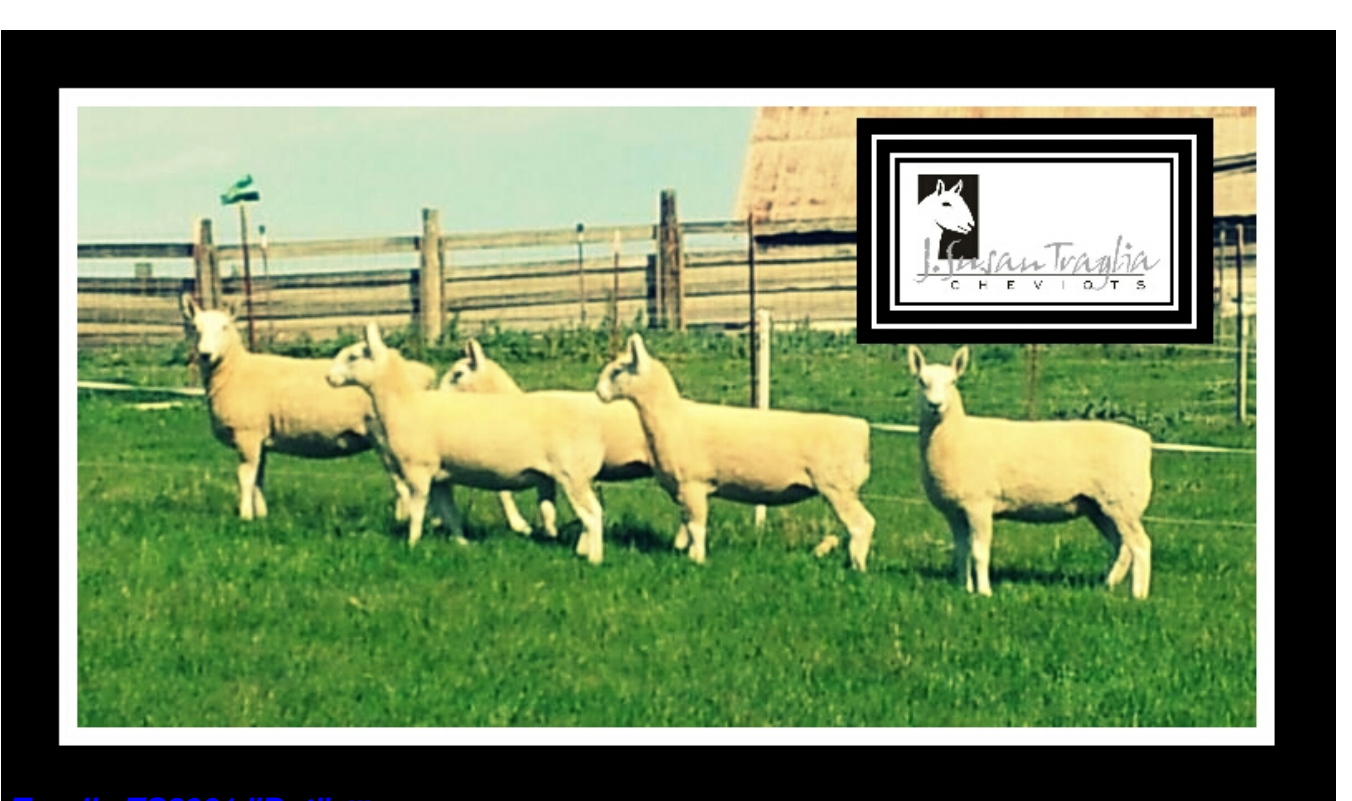
CHAPTE BURNER CONTROL OF TAXALLY