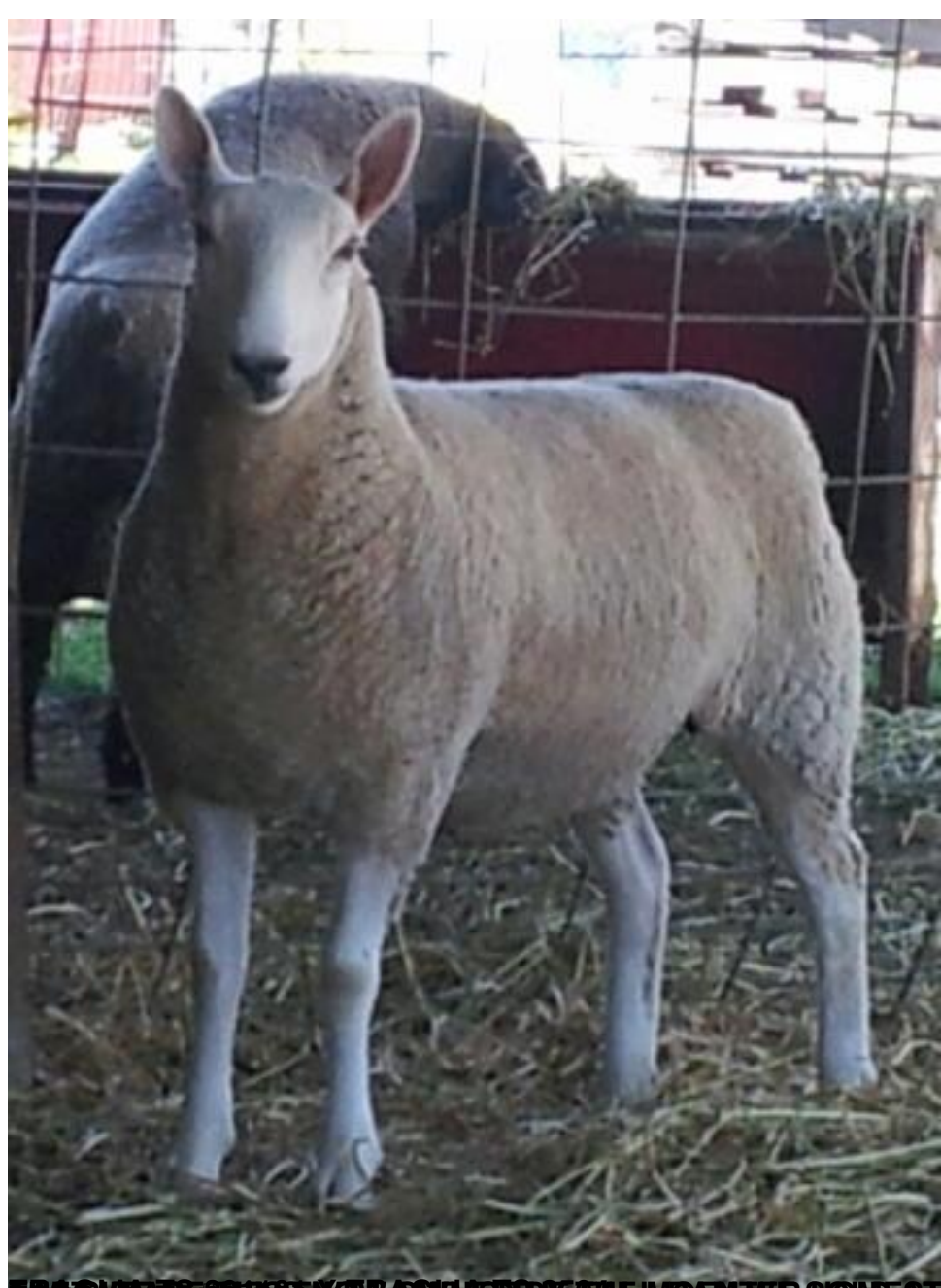
THE CHIEF STATE OF THE INVENTION ALL SALE